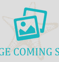
IMAGE COMING SOON

District: Bodden Town, Cayman Islands Price: CI$168,000 MLS# 417039 Type: Land Width: 120 Depth: 112 Status: Pen/Con