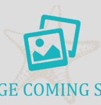
IMAGE COMING SOON