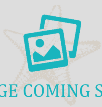
IMAGE COMING SOON

District: Seven Mile Beach, Cayman Islands Price: US$8,900,000 MLS# 416709 Type: Residential Beds: 4 Baths: 4.5 Status: Current