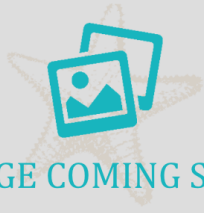
IMAGE COMING SOON

District: Seven Mile Beach, Cayman Islands Price: US$8,800,000 MLS# 417436 Type: Residential Beds: 6 Baths: 8 Status: Current