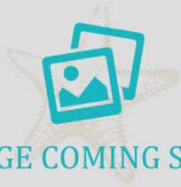
IMAGE COMING SOON