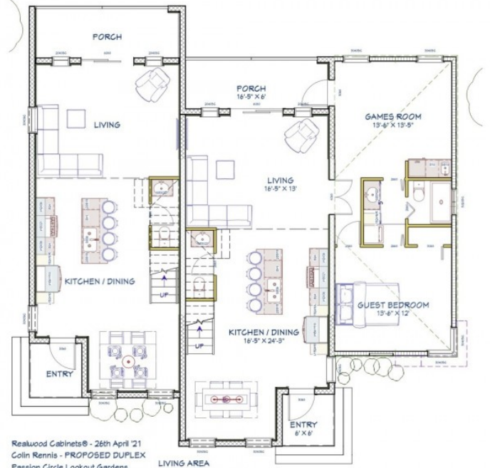
Reaewood Cabinets® - 26th April '21 Colin Rennis - PROPOSED DUPLEX Passion Circle Lookout Gardens, Bodden Town, Grand Cayman