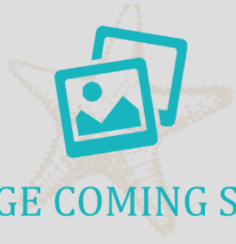
IMAGE COMING SOON