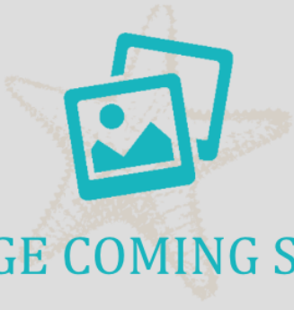
IMAGE COMING SOON