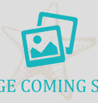
IMAGE COMING SOON