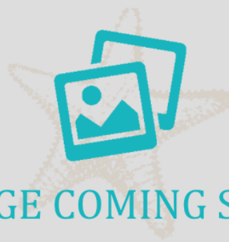
IMAGE COMING SOON