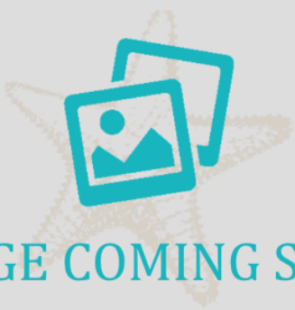
IMAGE COMING SOON