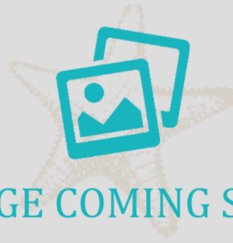
IMAGE COMING SOON