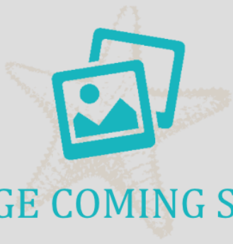
IMAGE COMING SOON