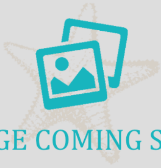
IMAGE COMING SOON