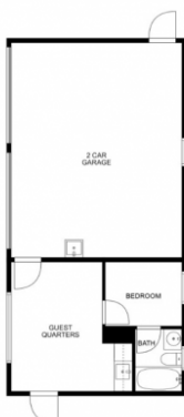
HIDDEN TREASURE 228 Seaview Drive