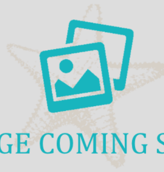
IMAGE COMING SOON