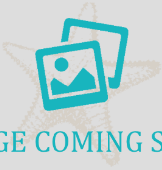
IMAGE COMING SOON