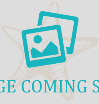
IMAGE COMING SOON