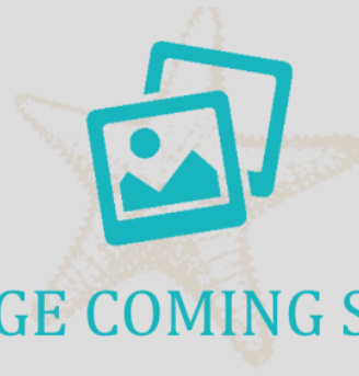
IMAGE COMING SOON